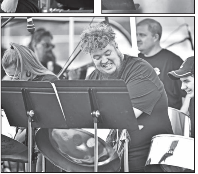
Band of Steel